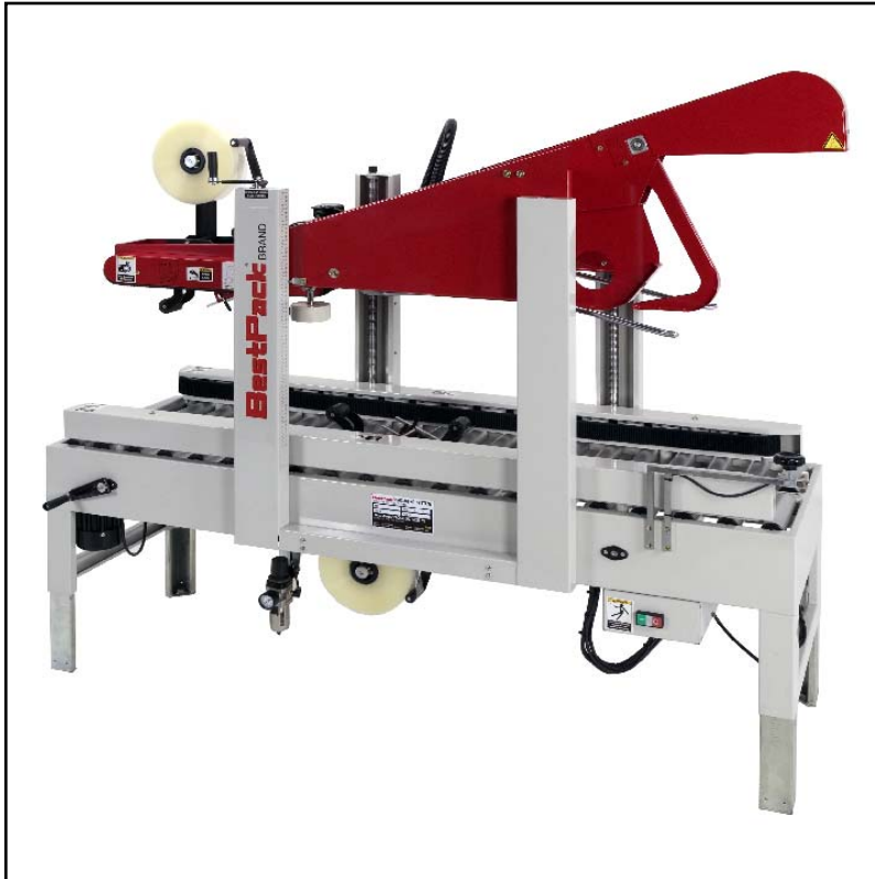
AQ Automatic Quad Drive

The BestPack® AQ series are operator-free, carton-sealing machines designed to meet the needs of uniform in-line carton closure applications.